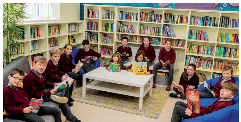
Students enjoying the new library at St. Finian’s National School, Waterville, Co. Kerry

Community donated more than 1,500 books to the school’s library campaign.