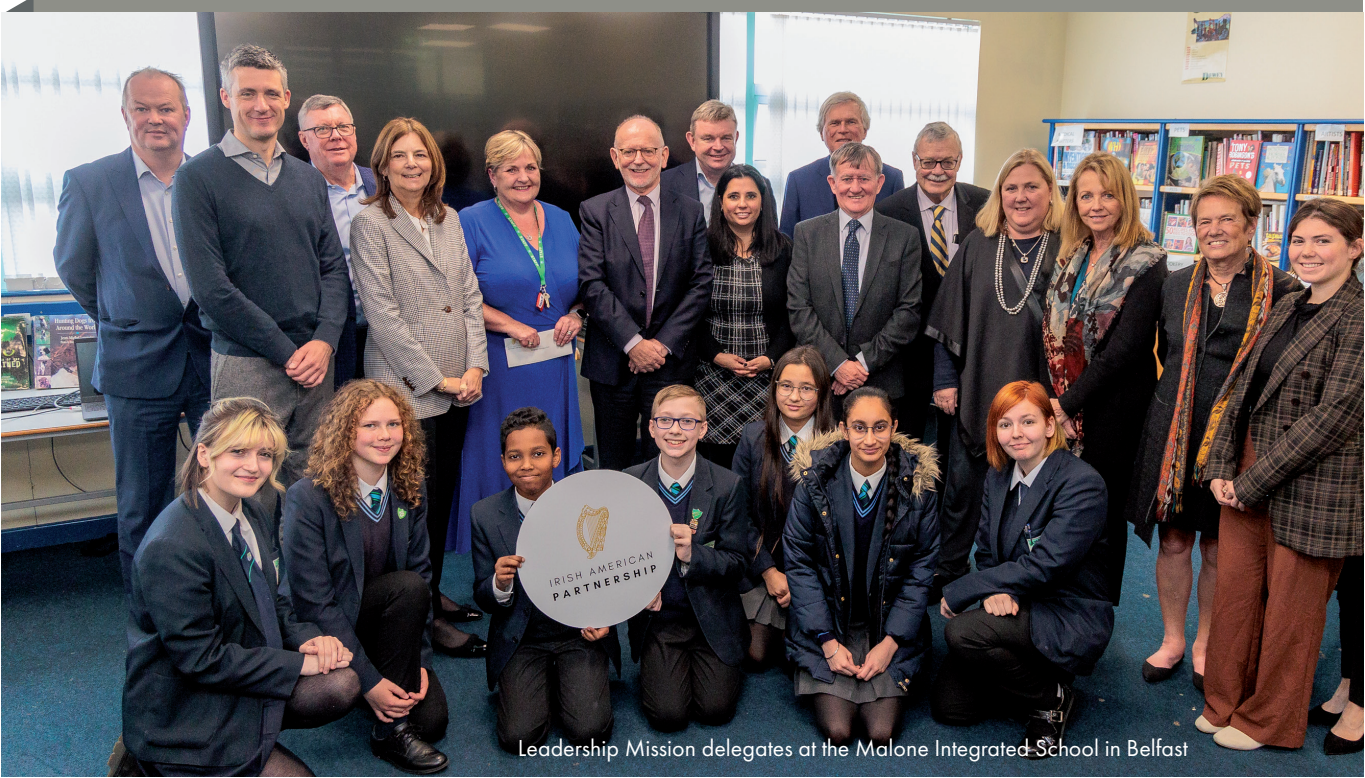
Leadership Mission delegates at the Malone Integrated School in Belfast