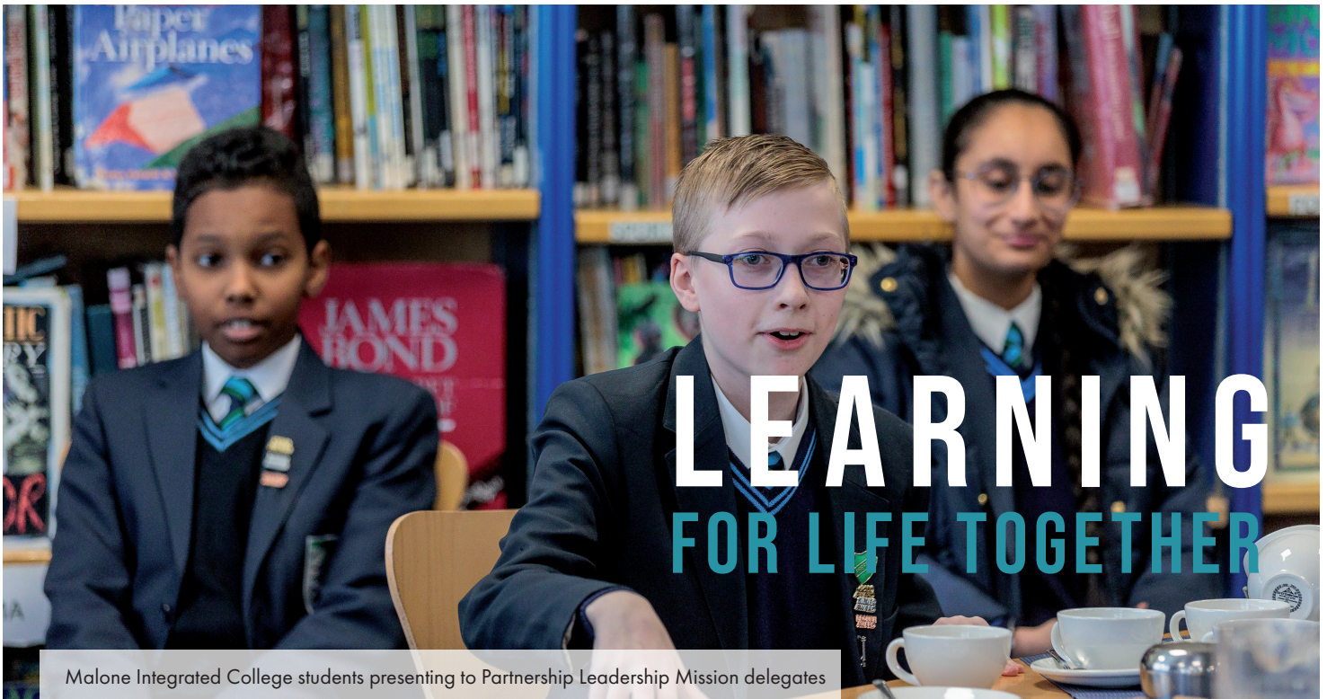
Malone Integrated College students presenting to Partnership Leadership Mission delegates

F ounded by parents in 1987, Malone Integrated College is a secondary school in West Belfast, serving a diverse body of students from wide socio-economic, ethnic, and cultural backgrounds across the city and beyond.