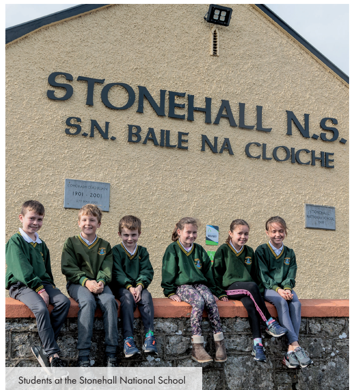
Students at the Stonehall National School