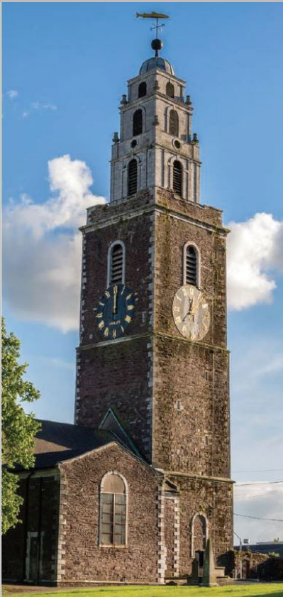
Church of St Anne, Cork City