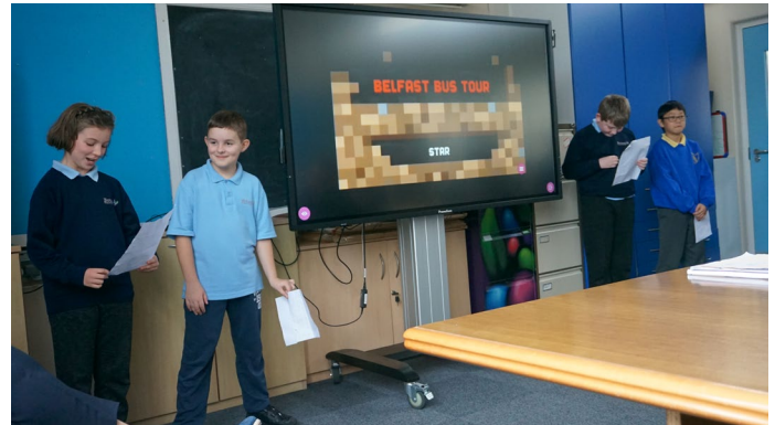
Students from Botanic and Holy Rosary Primary Schools in Belfast present on their Shared Education projects

Thus, the Partnership also funds Shared Education initiatives. These programs bring students from Protestant and Catholic Schools together to work on shared projects. Many of the programs are paired with initiatives to bring parents from both schools together, breaking down distrust and fear. The students love the opportunity to make new friends and create relationships that extend far beyond the classroom.