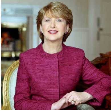
Mary McAleese Eighth President of Ireland