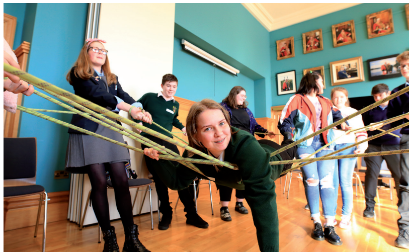
Pupils from Thornhill College, St Mary's College, Carndonagh Community College and Moville Community College participate in Educating the Heart