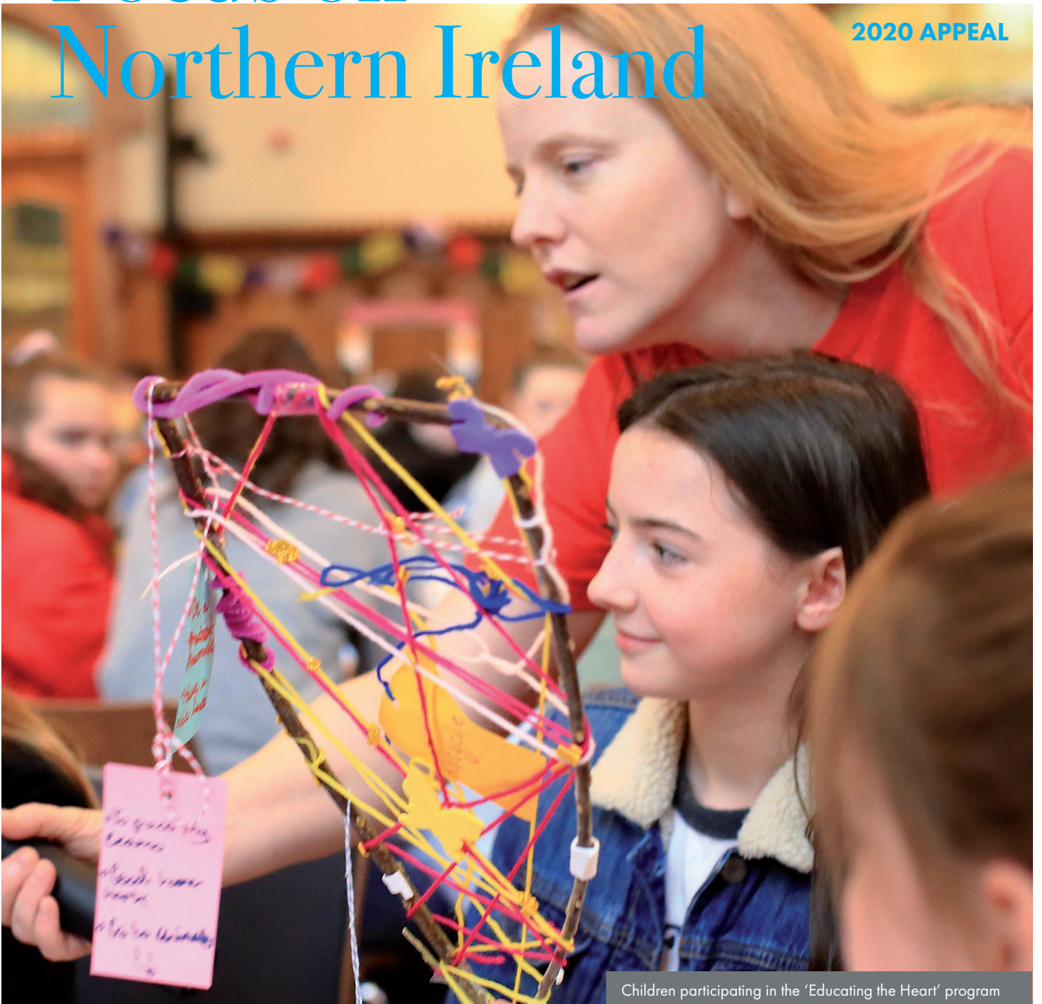
Children participating in the 'Educating the Heart' program