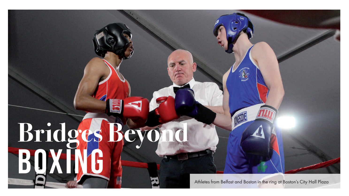
Bridging the way to a brighter future, this sports program cultivates teamwork, perseverance, and respect for cultural diversity.

stablished in 2016, Bridges Beyond Boxing (BBB) is a cross-community boxing exchange program that encourages the integration of young people from all traditions in Northern Ireland, as well as from other parts of Ireland.