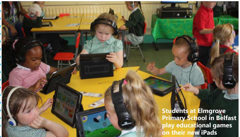
Students at Elmgrove Primary School in Belfast play educational games on their new iPads

The Boston-Belfast Sister City agreement was signed in Boston in 2014 to promote academic, cultural, and business links between the two cities. The Partnership has been actively involved in the agreement since its inception, and looks forward to creating more linkages in the years to come.