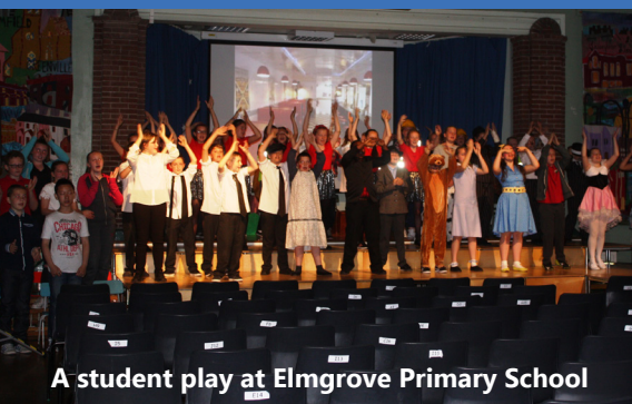
A student play at Elmgrove Primary School

St. Kieran's and Elmgrove were selected by the Lord Mayor's office for their disadvantaged designation and potential for growth. St. Kieran's Primary is a maintained school with 392 students, 86% of whom qualify for free school meals. This is the highest percentage of free school meal recipients (a common indicator of disadvantaged status) in Northern Ireland.