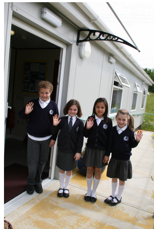
Portadown students outside their new classroom paid for by the Partnership