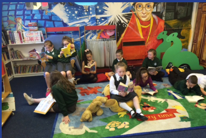
Students at St. Kieran's Primary School in Belfast participate in the lunchtime library club (top) and receive support as part of the accelerated reading program (bottom)