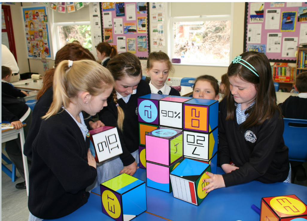
Students at Portadown Integrated Primary solve a math puzzle in their new classroom