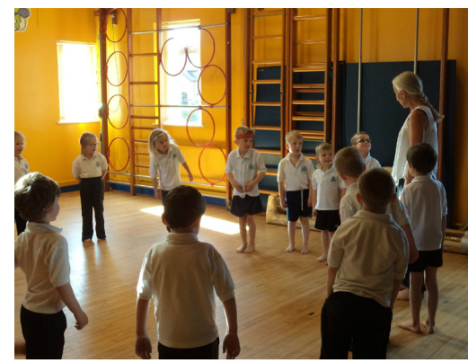
Knockloughrim Primary School in Northern Ireland does a dance workshop with Pushkin