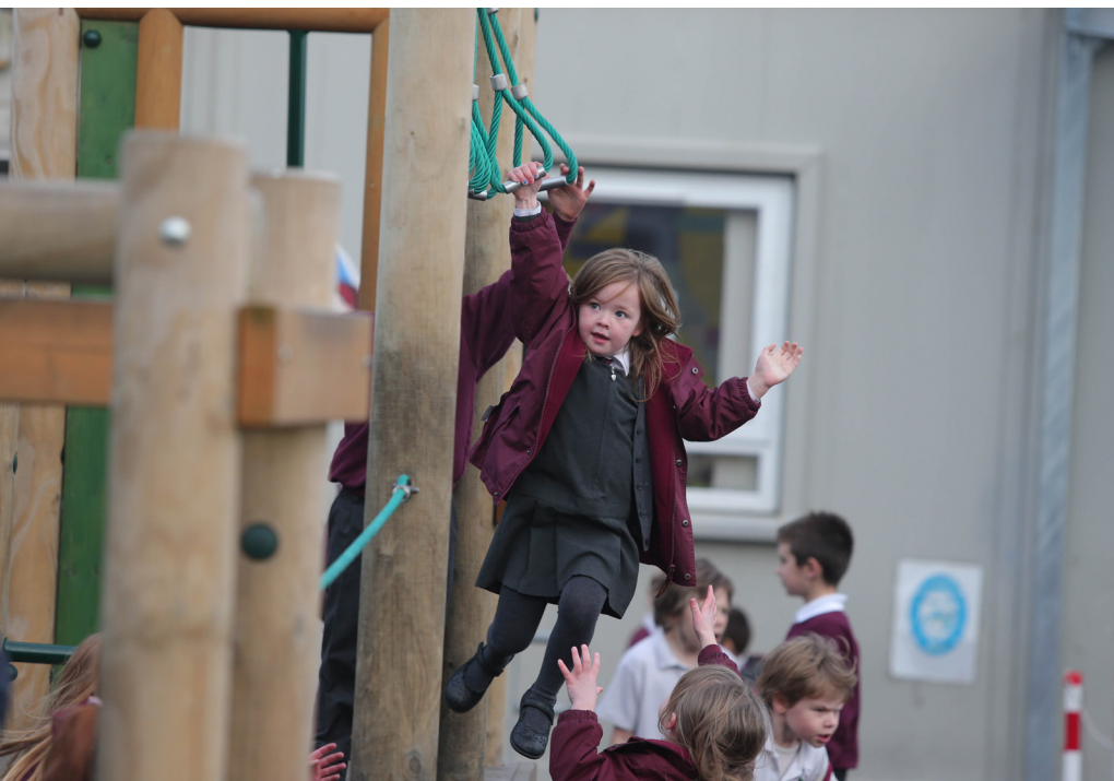
A student at Rowandale Integrated Primary School in Co. Down, a Partnership direct grant recipient