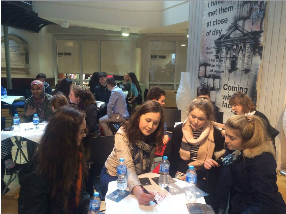
Teens from the North and South of Ireland work in small groups to discuss Irish identity through a program put on by the 174 Trust in Belfast

Recently, the 174 Trust hosted a workshop for teens from the North and South to discuss Irish identity at the Duncairn Cultural Arts Centre in Belfast. Here, students of all different races, religions, and socioeconomic backgrounds teamed up to discuss what their Irish identity meant to them and how all of their experiences can weave together into one common identity. The teens took this lofty task in stride, making word clouds to encapsulate different elements of Irish identity and presenting them with the group. By the end of the day, they not only explored and challenged their own notions of Irish identity, but made some new friends as well!