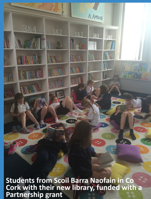
Students from Scoil Barra Naofain in Co Cork with their new library, funded with a Partnership grant

The Partnership also provides forums for visiting leaders from Ireland to speak in the U.S., connecting Irish-Americans with their heritage and promoting economic development through tourism, trade, and mutual exchange.