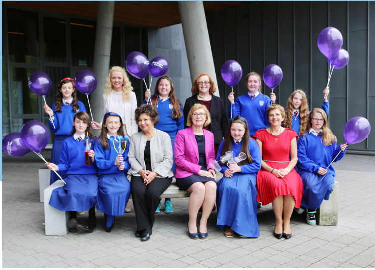
Minister for Education and Skills Jan O'Sullivan announces the RDS Science Fair in Limerick, co-sponsored by The Irish American Partnership

What is biodynamic gardening? What is the link between lung capacity and heart rate in relation to fitness? Does hens' feed affect the taste of their eggs?