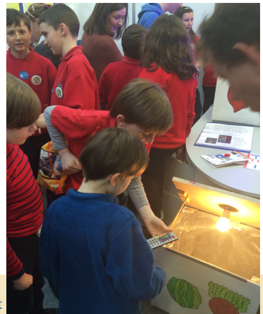
Students from Ballyvaughan National School, Co. Clare present their project on hydroponics at the 2015 RDS Primary Science Fair in Dublin

The Partnership and the RDS are grateful to have the support of the Irish government in their quest to instill a love for science learning in primary students. The skills students gain while preparing and presenting their projects at the RDS Fair extend far beyond the classroom. They learn teamwork, responsibility, and public speaking. And when things inevitably go awry, they develop the ability to cope, regroup, and try once again. But if you asked these bright young students about the RDS Fair, they would just say it was fun.