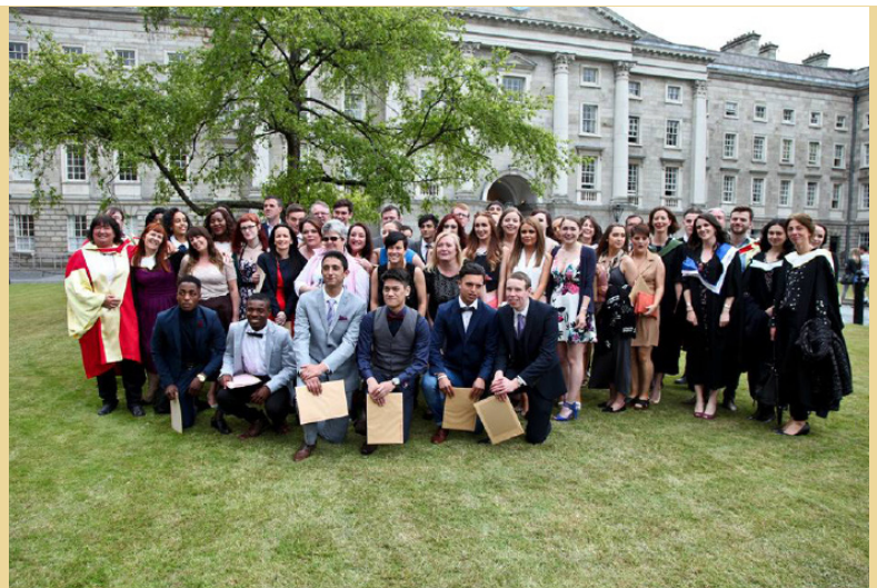
Access Scholarship recipients at Trinity's 2015 Graduation

The Partnership supports Access Programs at five Irish universities: Trinity College, Ulster University, Dublin City University, Queen’s University, and University of Limerick . These remarkable programs are innovating in the field of university accessibility. The coordinators understand that they cannot simply hand a student a tuition check and expect them to succeed in university. They know that students from disadvantaged areas may be behind in certain subjects or may feel socially ostracized from their peers. So they create a welcoming environment for students to truly thrive, offering counseling services, peer discussion groups, tutoring, volunteer opportunities, housing stipends, and more. Most importantly, they insure students in the access program are fully integrated in the campus community, encouraging extra-curricular participation, academic research, and in many cases, on-campus living. These efforts address students needs on a social, economic, and emotional level, truly leveling the playing field for disadvantaged students.